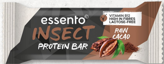
Essento Insect Protein Bar Raw Cacao