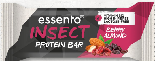
Essento Insect Protein Bar Berry Almond